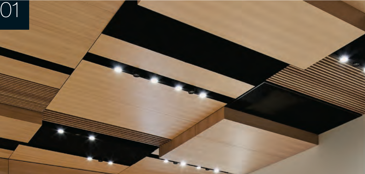
Infinity Premium acoustic solutions range of architectural and acoustic panelling systems that are fully customisable and offer leading acoustic performance. Architects and designers depend on the high end quality of our Infinity range to deliver a result that is functional, beautiful and fully customisable.