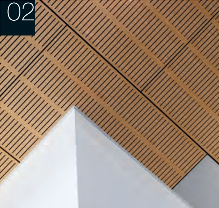
Quantum Modular acoustic solutions range is an efficient and economical solution for projects where timing and budgets might be limited, but style and aesthetic is paramount. Available in a range of standard sizes, profiles and finishes, it includes solid infill panels that can be cut on site to suit most wall and ceiling size requirements.