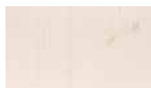
Limed Hoop Pine / Textured