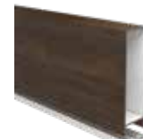
50 x 170mm Batten