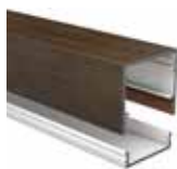
45 x 40mm Batten