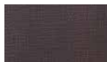
Wenge / Textured