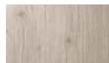
Alaskan Fig / Textured