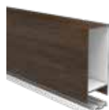
50 x 120mm Batten