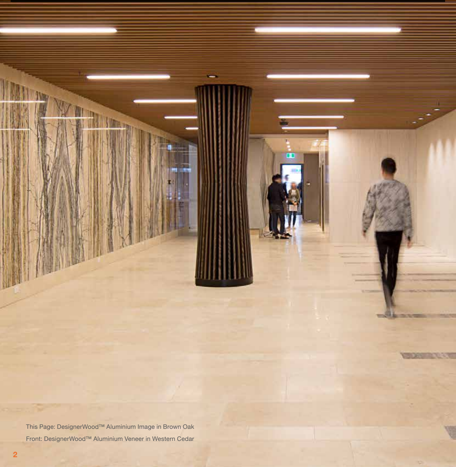
This Page: DesignerWood™ Aluminium Image in Brown Oak Front: DesignerWood™ Aluminium Veneer in Western Cedar