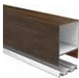
50 x 70mm Batten