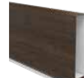
50 x 220mm Batten